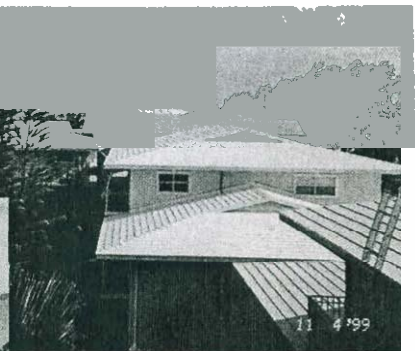
Three of the four buildings in the Christopher Columbus resort are visible in this photo (before reroofing, left, and after, right).

the roof was a bad combination. The paint was observed to bridge between overlying shingle tabs in some areas but not in others. Due to the low slope of the roof, the shingles were vulnerable to water penetration during high winds. Once the water penetrated the shingles, it could migrate laterally and become trapped under the elastomeric coating. Evidence of long-term water intrusion was noted in the discoloration of the white roof surface caused by corrosion of underlying roofing nails and soft areas in the plywood roof deck which were detected while walking on the roof.